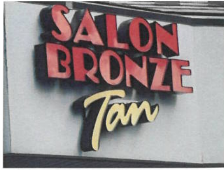
Example of Channel Lettering

CHANNELIZATION. Any improvements or other construction activity which occurs within or in the vicinity of an existing natural drainage-way or perennial stream which directs or relocates said waterway along some desired course, by increasing its depth or by the use of piping or any other manmade storm drainage structures.