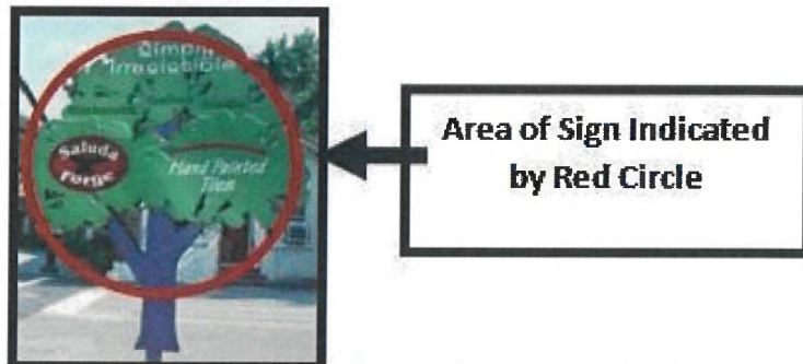
Example Illustrating Measurement of the Area of an Irregularly Shaped Sign

SIGN AREA. The size of a sign in square feet as computed by the area of not more than two standard geometric shapes (specifically circles, squares, rectangles, or triangles) that encompass the shape of the sign exclusive of the supporting structure.