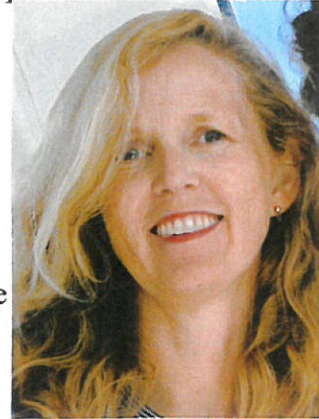
Pic. July 21, 2011